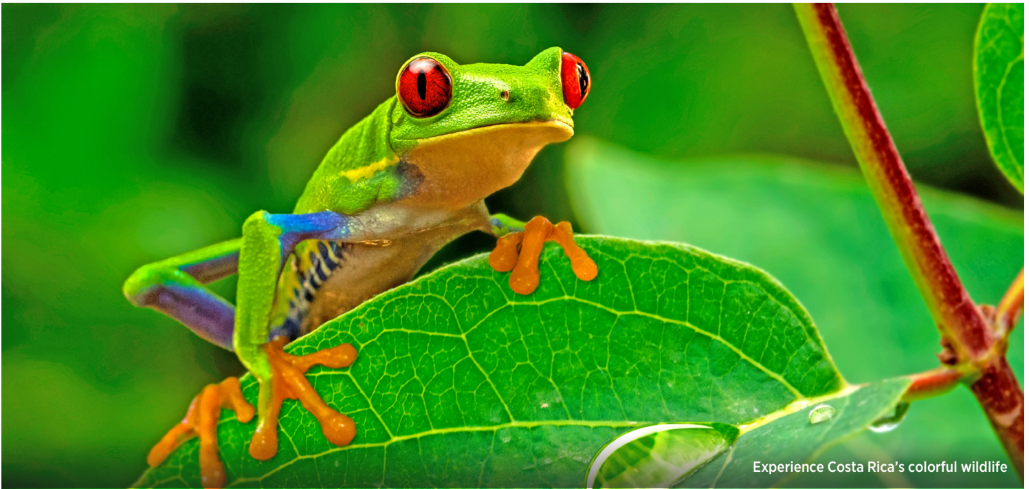
Experience Costa Rica's colorful wildlife