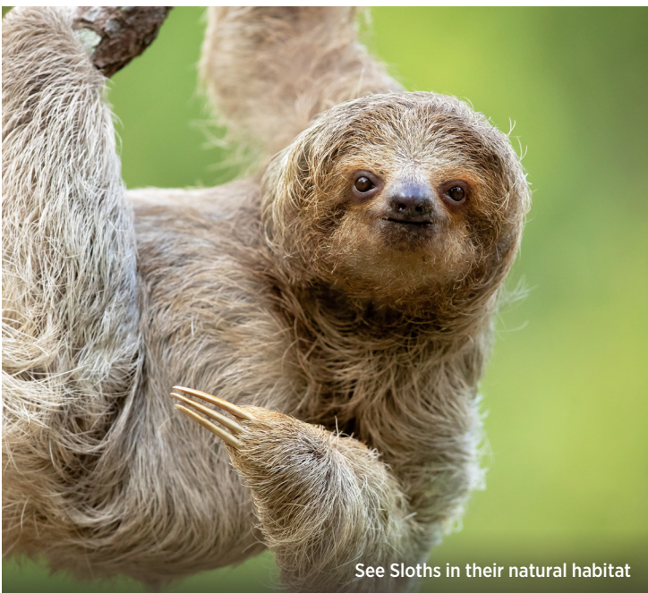
See Sloths in their natural habitat

While in the Arenal area, enjoy a full day excursion to Caño Negro National Wildlife Refuge, a remote "everglades" type wetlands, teeming with different species of flora, fauna and birdlife. Enjoy a boat ride on the Rio Frio, where you'll have an opportunity to see a plethora of wildlife: snake-birds, heron, comorants, howler, spider and white-faced monkeys, three-toed sloth, basilisk lizards (also known as Jesus Christ lizards), turtles and much more. This unique experience showcases the natural beauty of Costa Rica. A typical lunch is provided during the excursion. This evening, dinner is included at the hotel. Meals: B, L, D