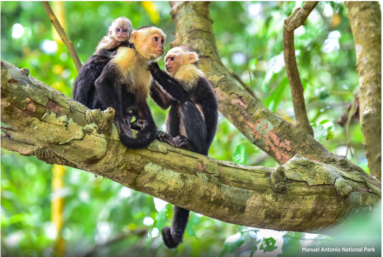
Manuel Antonio National Park