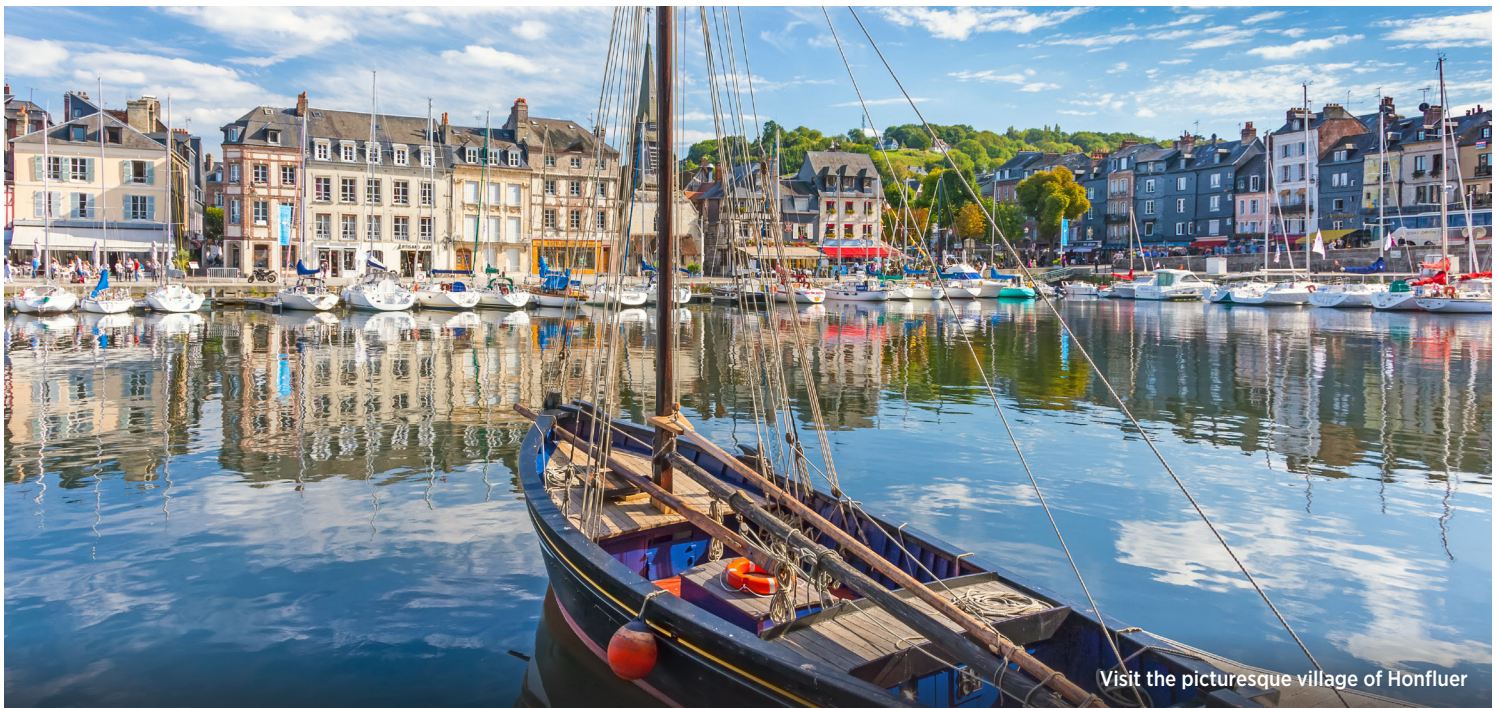
Visit the picturesque village of Honfleur