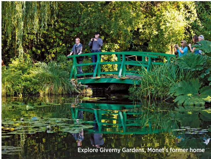
Explore Giverny Gardens, Monet's former home

Experience first-hand the Normandy beaches where the Allied vessels landed, as well as the memorials and museum, which honor the bravery of those involved and their ultimate sacrifice. Your Star-Ship remains docked in Honfleur overnight. Meals: B, L, D